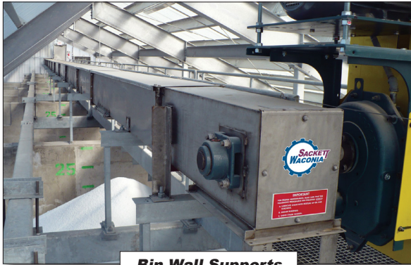
Bin Wall Supports