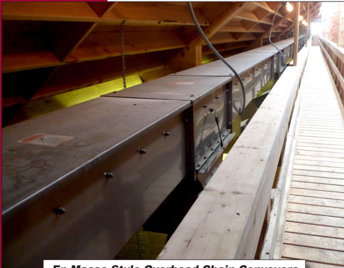
En Masse Style Overhead Chain Conveyors