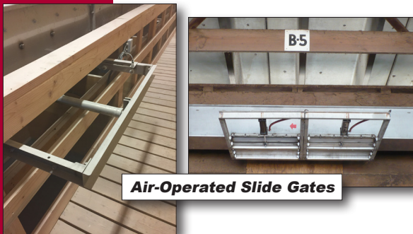
Air-Operated Slide Gates