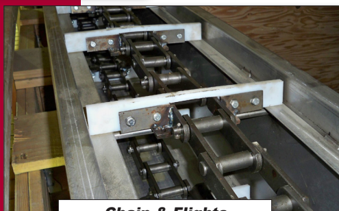
Chain & Flights