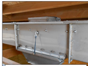
Manual Slide Gates