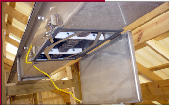
Drop-out Style Hinged Gates