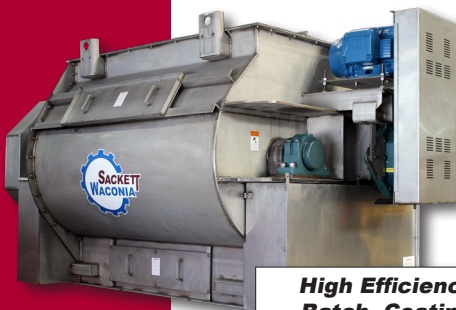
High Efficiency Batch Coating