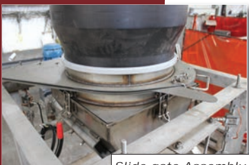
Slide gate Assembly

The Feeder supports the full range of powdered micronutrients and target dosing rates. With the use of a VFD, the feeder can handle all product minimum and maximum rates without slowing the blend cycle (with the exception of copper below 0.01%, due to its small volume). Each feeder is individually scaled and features a 4-point tension load cell system. Dosing is achieved by a 4" screw, and soft connections are provided as necessary.