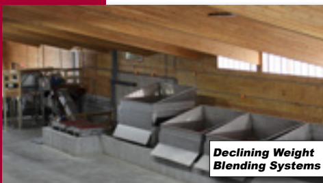
Declining Weight Blending Systems