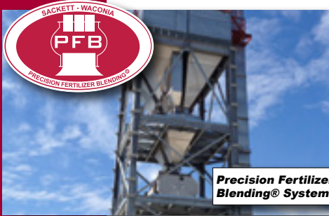
Precision Fertilizer Blending® Systems