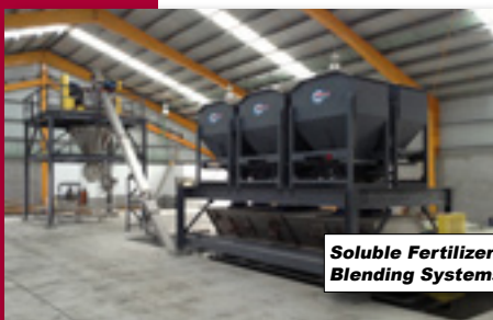
Soluble Fertilizer Blending Systems